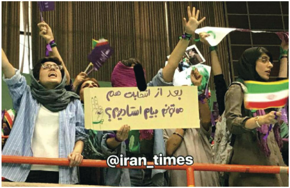
During a political meeting in a stadium, Iranians claim the right to attend matches: "EVEN AFTER THE ELECTIONS I SHALL COME TO THE STADIUMS."

Saudi Arabia has just lifted its ban against women entering stadiums. Iran has only yielded in several cases, always under international pressure – and continues to forbid women to enter stadiums generally.