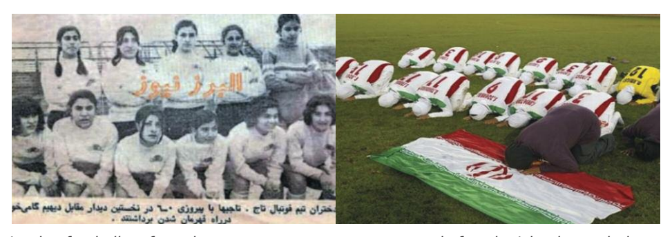
Iranian footballers formely...