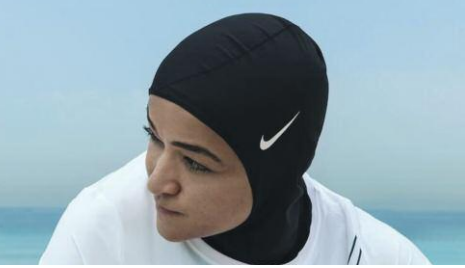
Manal Rostom is one of the Nike muses

The economic benefits amount to billions of dollars if one adds to them H&M clothing, Uniqlo, etc... This is the height of absurdity: an outfit totally discriminatory becomes the symbol of progress and freedom!