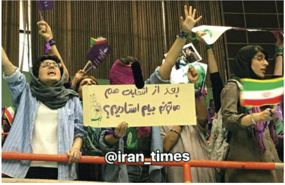
During a political meeting in a stadium, Iranians claim the right to attend matches: "Even AFTER THE ELECTIONS I SHALL COME TO THE STADIUMS."

Saudi Arabia has just lifted its ban against women entering stadiums. Iran has only yielded in several cases, always under international pressure.