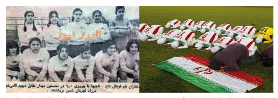
Iranian footballers formely...