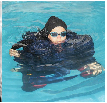
and after the Islamic revolution.