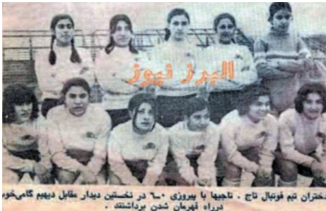
Iranian footballers before...