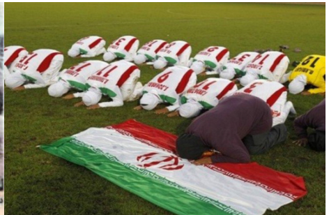
and after the Islamic revolution.