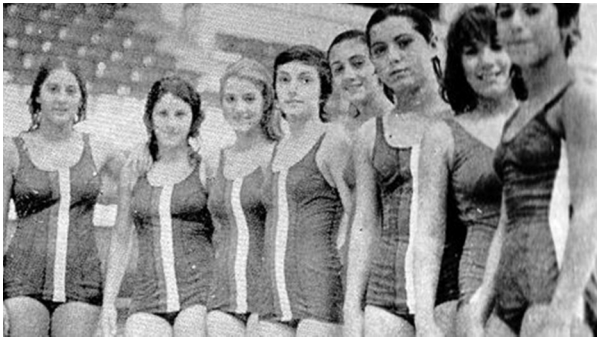
Iranian swimmers before...